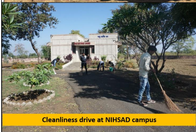
Cleanliness drive at NIHSAD campus