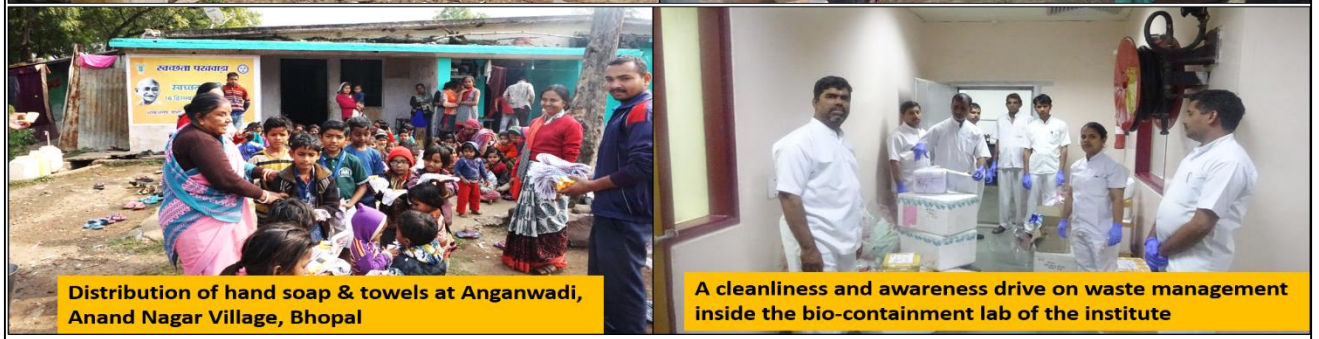
Distribution of hand soap & towels at Anganwadi, Anand Nagar Village, Bhopal