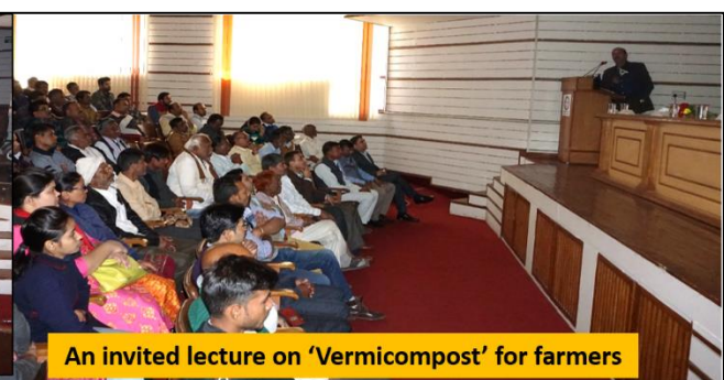
An invited lecture on 'Vermicompost' for farmers