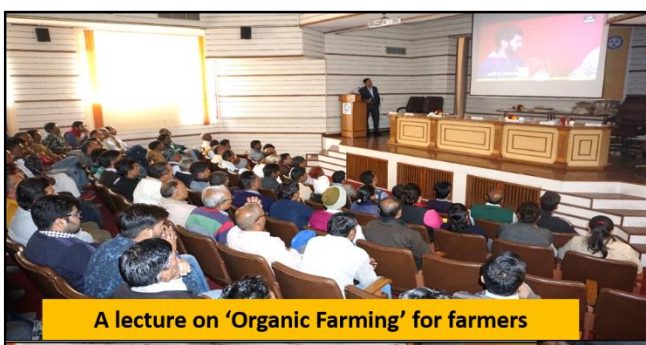
A lecture on 'Organic Farming' for farmers

Cleanliness drive at a tourist spot and creating awareness on treatment & safe disposal of bio-degradable and non-bio-degradable wastes at ICAR-NIHSAD, Bhopal