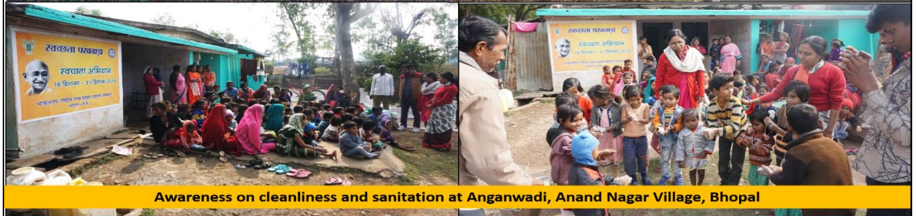
Awareness on cleanliness and sanitation at Anganwadi, Anand Nagar Village, Bhopal