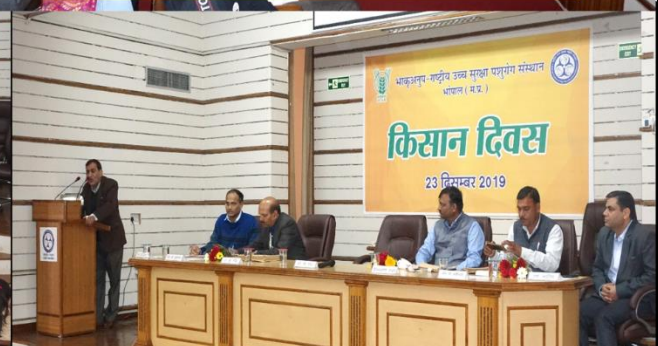
The Director, ICAR-NIHSAD addressing the farmers on the occasion of Kisan Diwas

Celebration of 'Kisan Diwas' at ICAR-NIHSAD, Bhopal