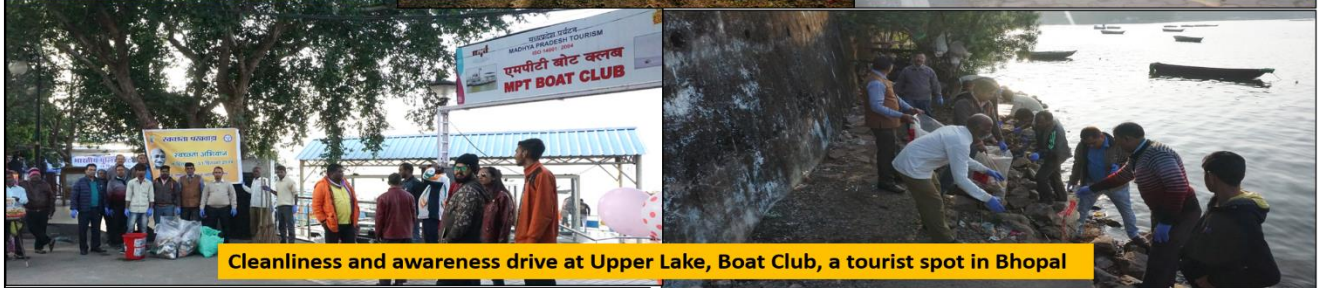
Cleanliness and awareness drive at Upper Lake, Boat Club, a tourist spot in Bhopal