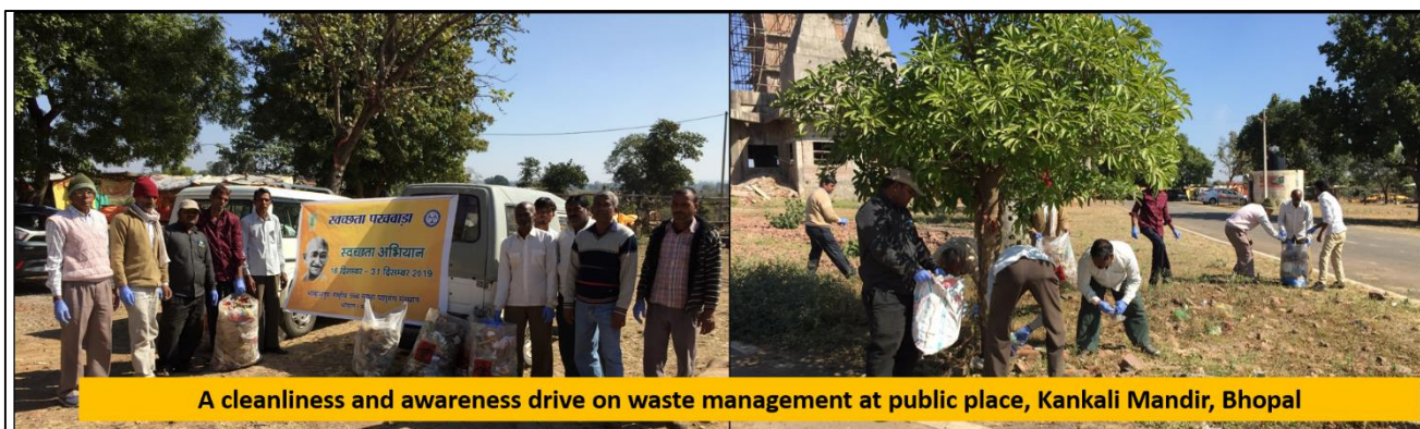
A cleanliness and awareness drive on waste management at public place, Kankali Mandir, Bhopal