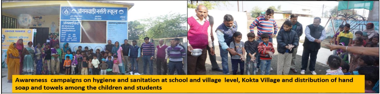
Awareness campaigns on hygiene and sanitation at school and village level, Kokta Village and distribution of hand soap and towels among the children and students