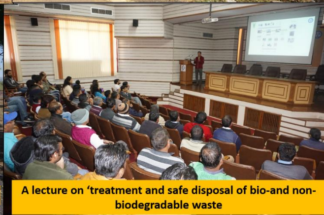
A lecture on 'treatment and safe disposal of bio-and non-biodegradable waste'

Cleanliness drive at a tourist spot and creating awareness on treatment & safe disposal of bio-degradable and non-bio-degradable wastes at ICAR-NIHSAD, Bhopal