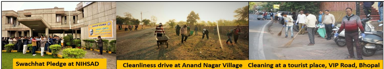
Swachhat Pledge at NIHSAD