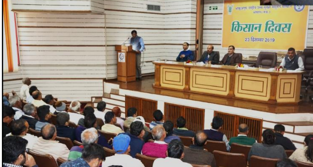
Farmers sharing their experiences on Swachhta Initiatives taken at their villages